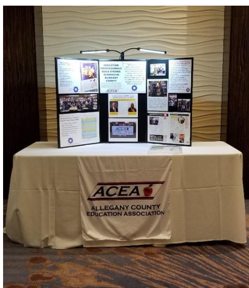
ACEA was represented at the recent 2025 Mt. Maryland PACE Reception in Annapolis on January 16-17.

They are the unsung heroes of our schools, who often go unnoticed because their jobs operate in the background. Yet without any one of these essential workers, our students would suffer, our classrooms would suffer, and our schools would suffer. Our union continues to recognize their value to our students and fight for the ESP Bill of Rights—a campaign that includes a living wage, affordable healthcare, safe work environments, career advancement, and job security. Their jobs are critical to the work that happens across Allegany County, and they deserve to be recognized for the essential role they play in our schools.